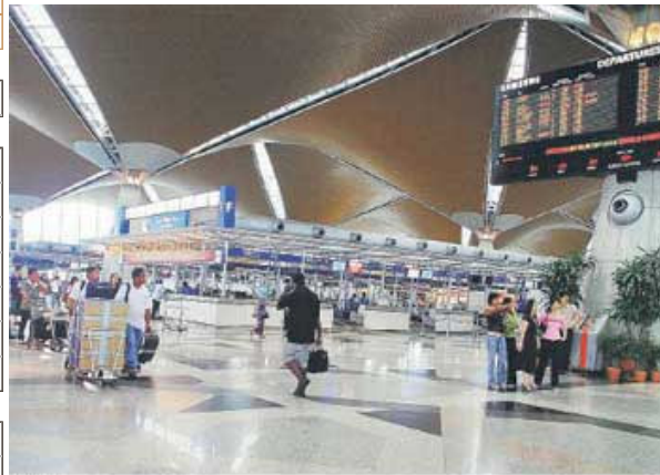
Klia bags an award

I CONGRATULATE Malaysia Airports Berhad for KLIA's win as the best airport in the world in the 15 million-25 million passenger category.