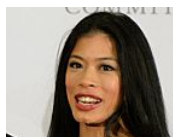
Thailand to 'be more careful' after Vanessa Mae ban