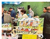
'Kampung Boy' a big hit in Japan