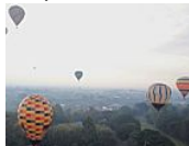
Updated: Five Malaysians among 15 injured in Cappadocia hot-air...