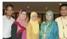
TM BREAKS FAST WITH CUSTOMERS