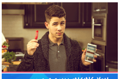
NICK JONAS IS (HALLENGING YOU TO MAKE AN IMPACT EVERY DAY- BIG OR SMALL

With the many universities, institutes, NGOs and professionals they should also be able to come up with flood mitigation plans that should not always involve river deepening and widening. There should also be a comprehensive plan that involves everyone to ensure that any developments approved including design of houses should take into