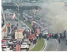
Massive jam due to Jalan Kuching crash (with video)

( http://www.nst.com.my/news/2015/09/massive-jam-due-jalan-kuching-crash-video ) ( http://www.nst.com.my/node/92989 )