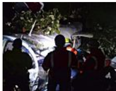
Two killed as Tom Cruise movie crew plane crashes in Colombia

( http://www.nst.com.my/node/93406 ) ( http://www.nst.com.my/news/2015/09/two-killed-tom-cruise-movie-crew-plane-crashes-colombia )