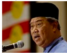
Muhyiddin advises Umno members to face reality