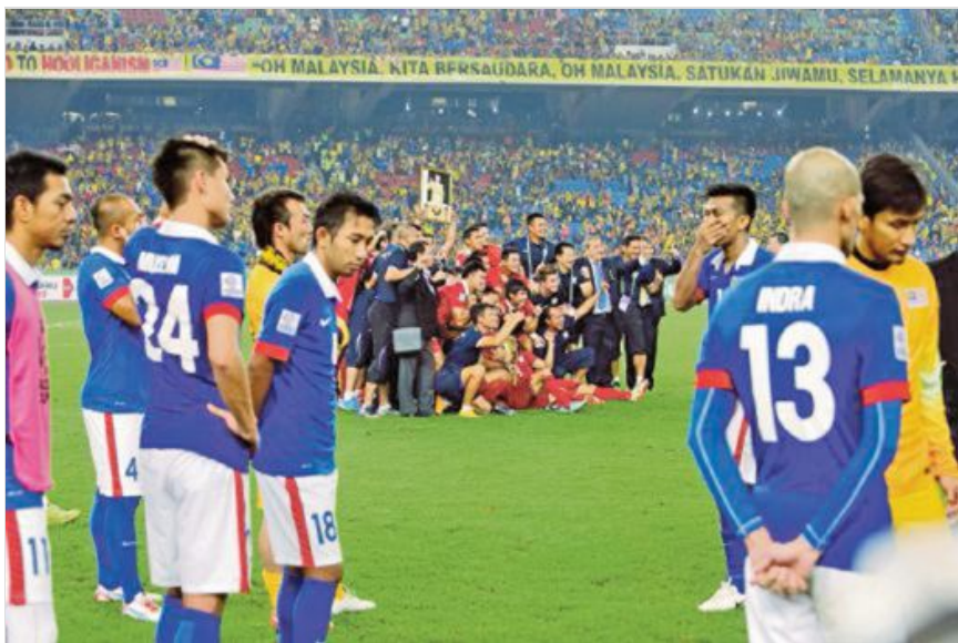
The Thai national team celebrating after the AFF Suzuki Cup finals last year while Harimau Malaysia players (foreground) look on. We need to equip players with the spirit and will to fight.