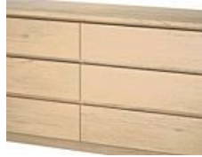
After 2 deaths, Ikea recalls 27m Malm chests, dressers

( http://www.nst.com.my/news/2015/09/massive-jam-due-jalan-kuching-crash-video ) ( http://www.nst.com.my/node/92989 )