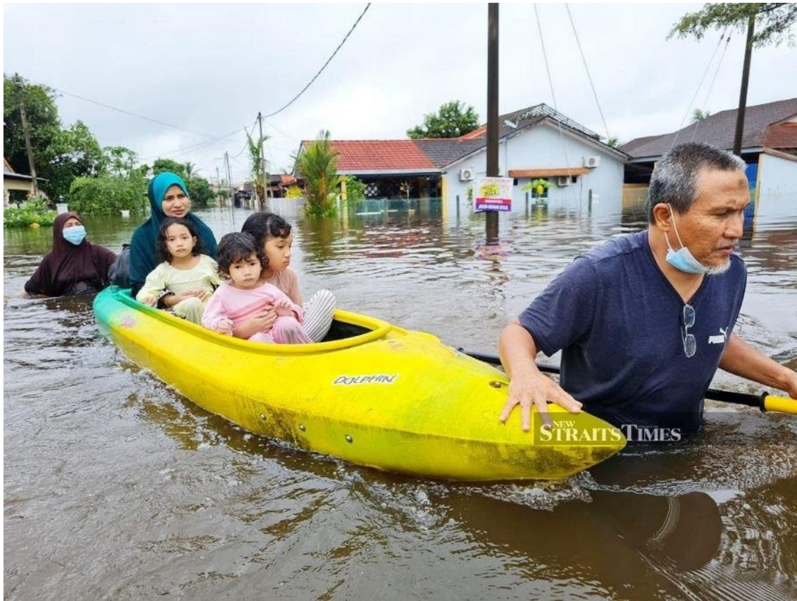
Everything that can go wrong went wrong for the Dec 17, 2021 weekend floods in eight of the 11 peninsula states.